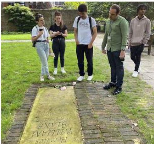
Year 12s on their literary walk in London.